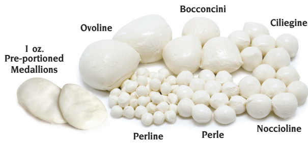
Fresh Mozzarella in Water