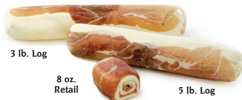
Fresh Mozzarella with Prosciutto