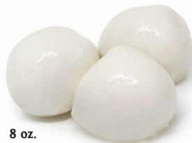
Fior di Latte