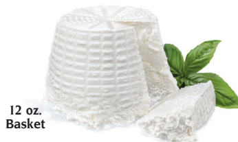
Ricotta di Bufala