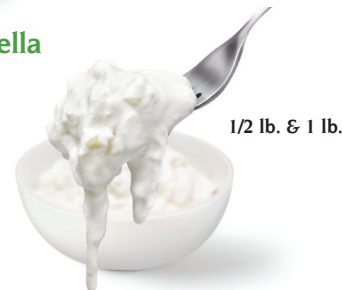
Stracciatella Panna di Latte