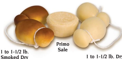
Dry & Smoked Dry Mozzarella